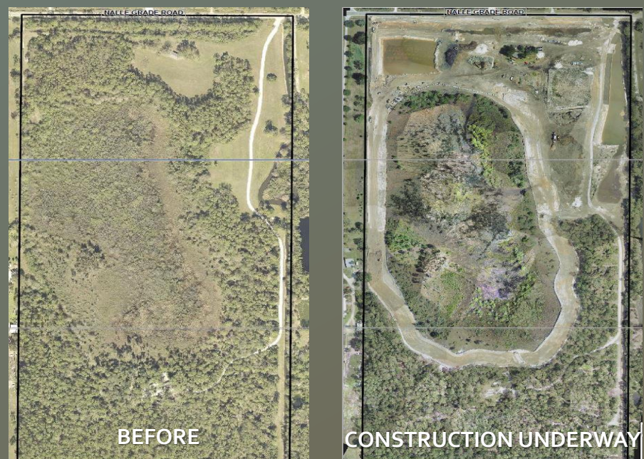
Nalle Grade Stormwater Park