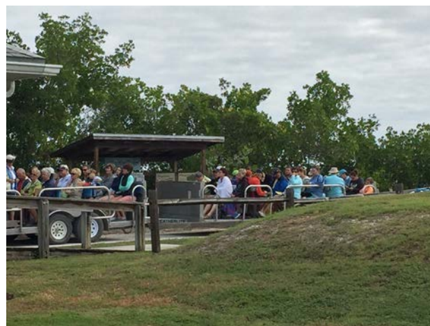
Two tram cars are required to service the volume of visitors in season.