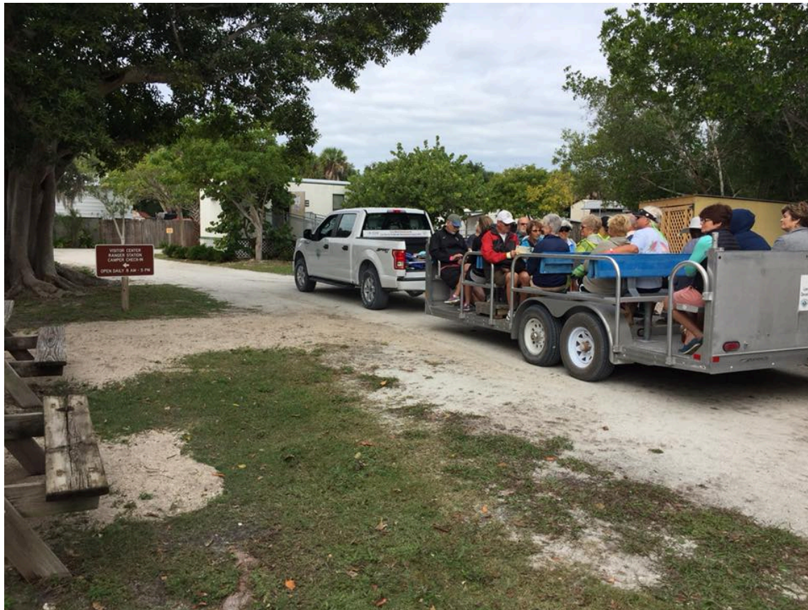
TDC Funded truck pulls tram car.